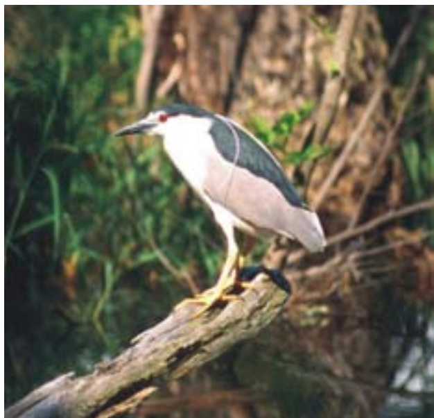
Above: Black-Crowned Night Heron

From its once pristine condition two centuries ago, the Meramec suffered from our uses and abuses. Forests were clearcut, farm fields were cleared to the water's edge, agricultural chemicals leached into the river, improperly functioning sewage treatment plants discharged waste-