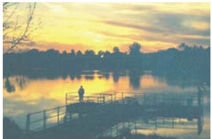
Above: Fishing from the dock at Simpson Park Lake.

The list of recreational opportunities goes on and on. Campers at Meramec State Park can explore Fisher Cave with lanterns; float fishermen can seek the elusive (Continues on page 2)